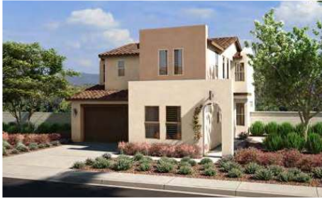
4A - MODERN SPANISH