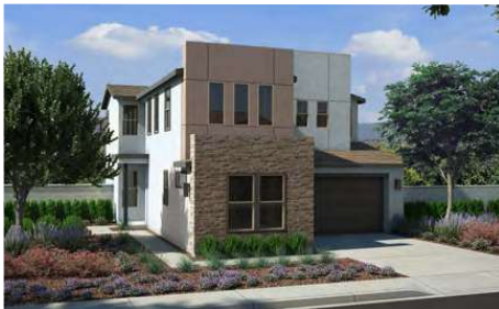
4B - DESERT CONTEMPORARY