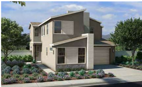
4C - NEVADA LIVING