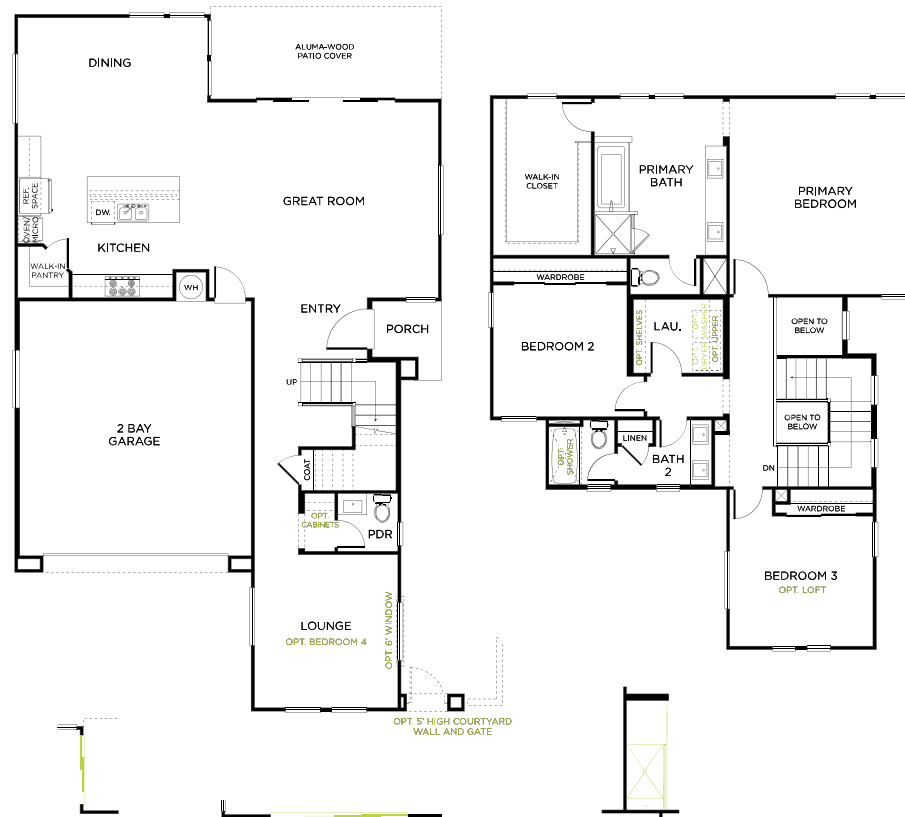
Optional 6ft Sliding Door at Dining Room