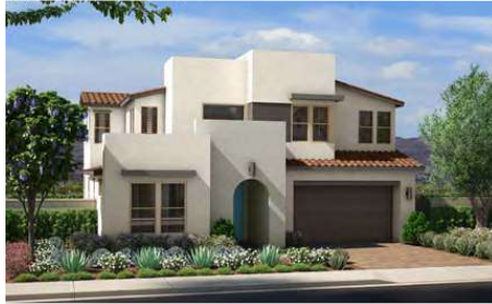
1A - MODERN SPANISH