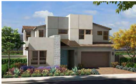
1B - DESERT CONTEMPORARY