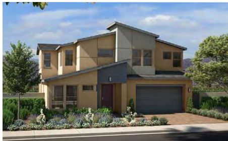
1C - NEVADA LIVING