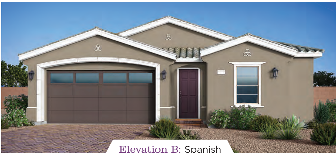
Elevation B: Spanish