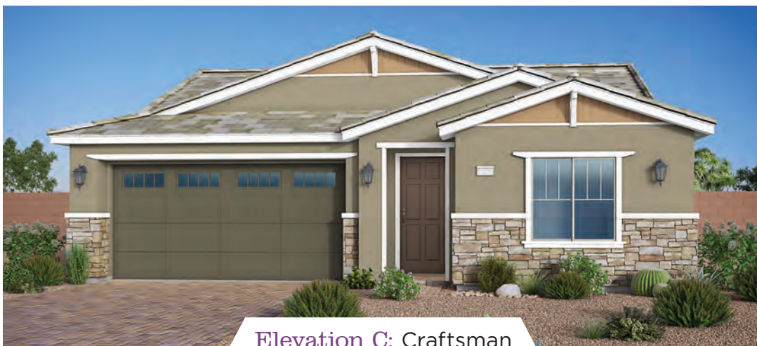
Elevation C: Craftsman