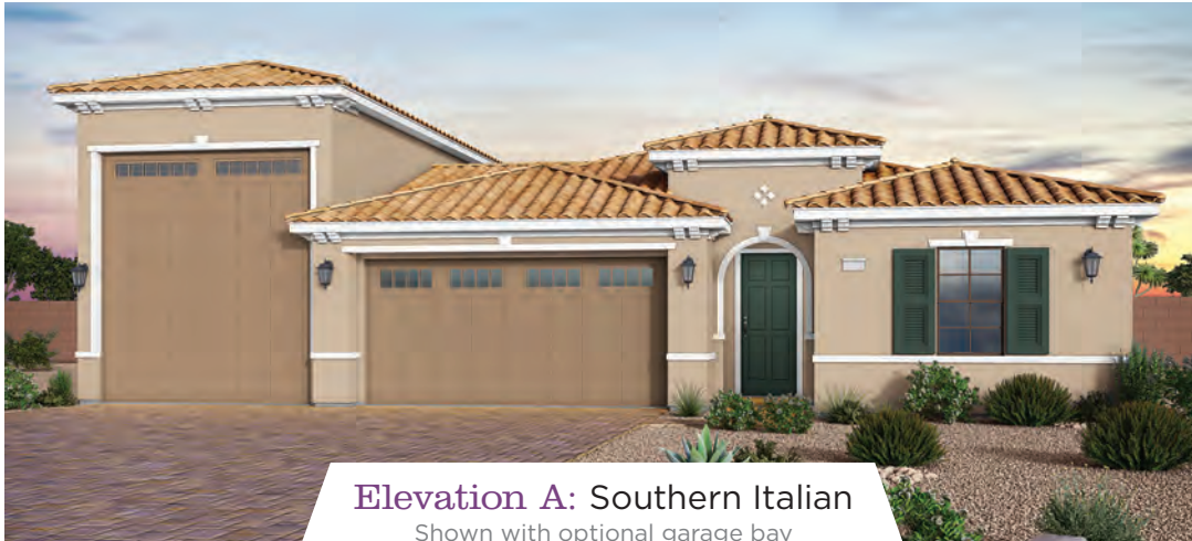
Elevation A: Southern Italian Shown with optional garage bay

3 BEDS | 2 BATHS | 2-BAY GARAGE | 1,935 SQ FT