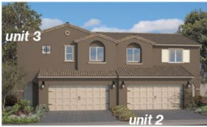
Building B – Elevation A