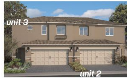
Building B – Elevation C