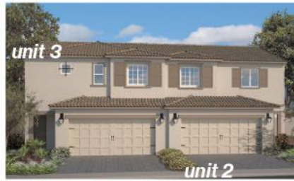
Building B – Elevation B