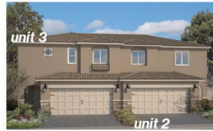
Building B – Elevation C