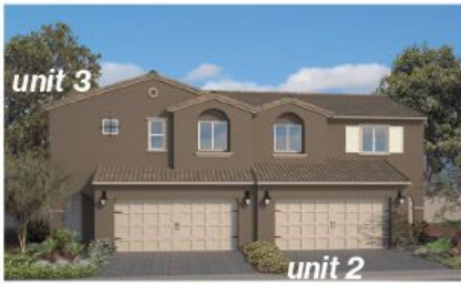
Building B – Elevation A