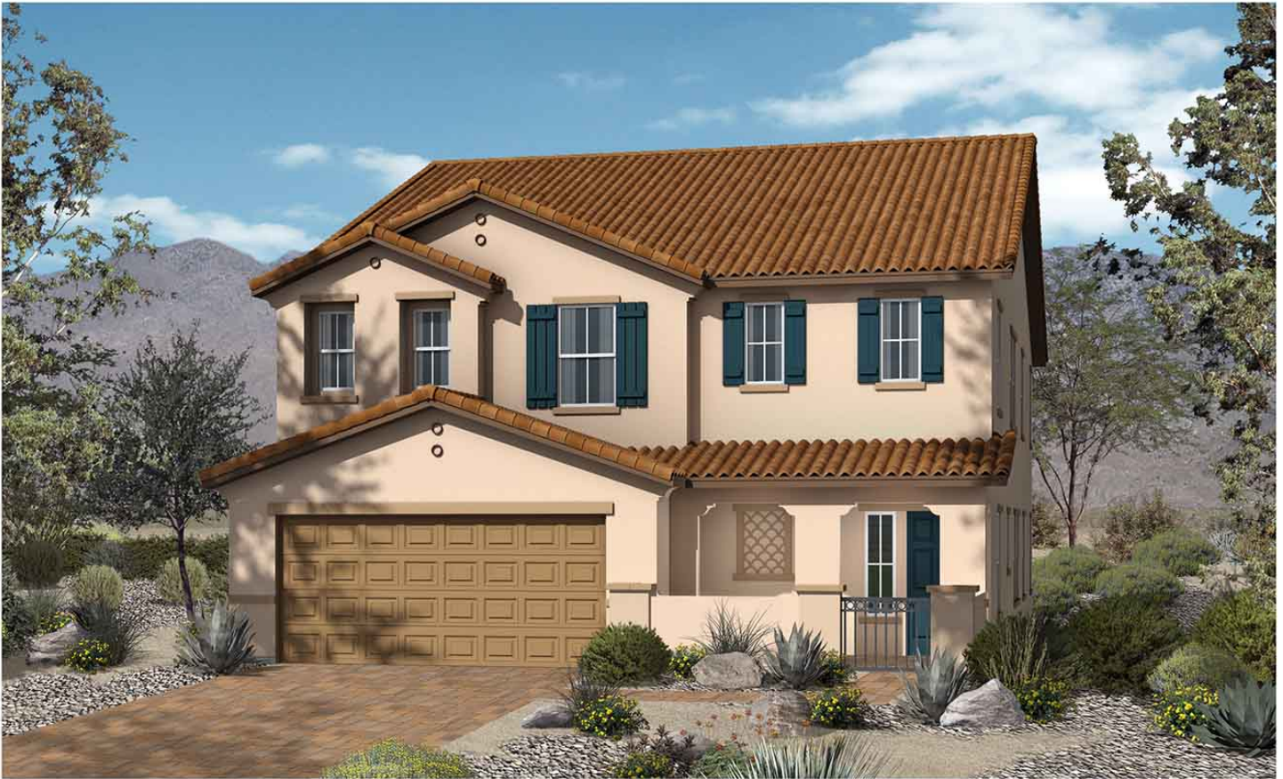
3059 A - Scheme 27 NV-LV Inspirada 35'