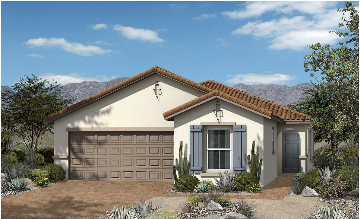
1849 A -Scheme 25 NV-LV Inspirada 35'