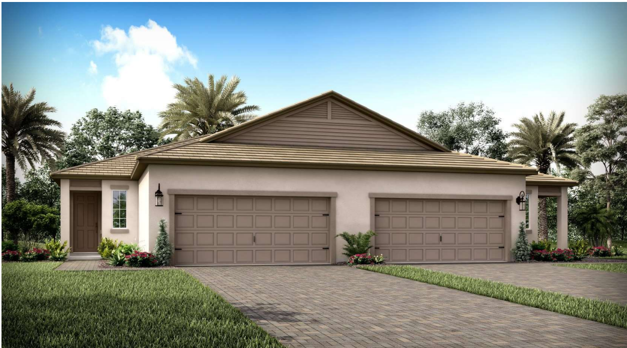
Elevation West Indies