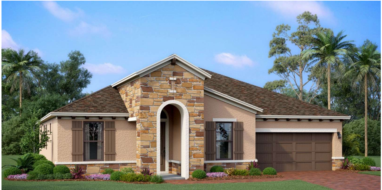
Elevation B Tuscan

4 Beds | 3 Baths | 3 Car Garage | 2,774 sq. ft.