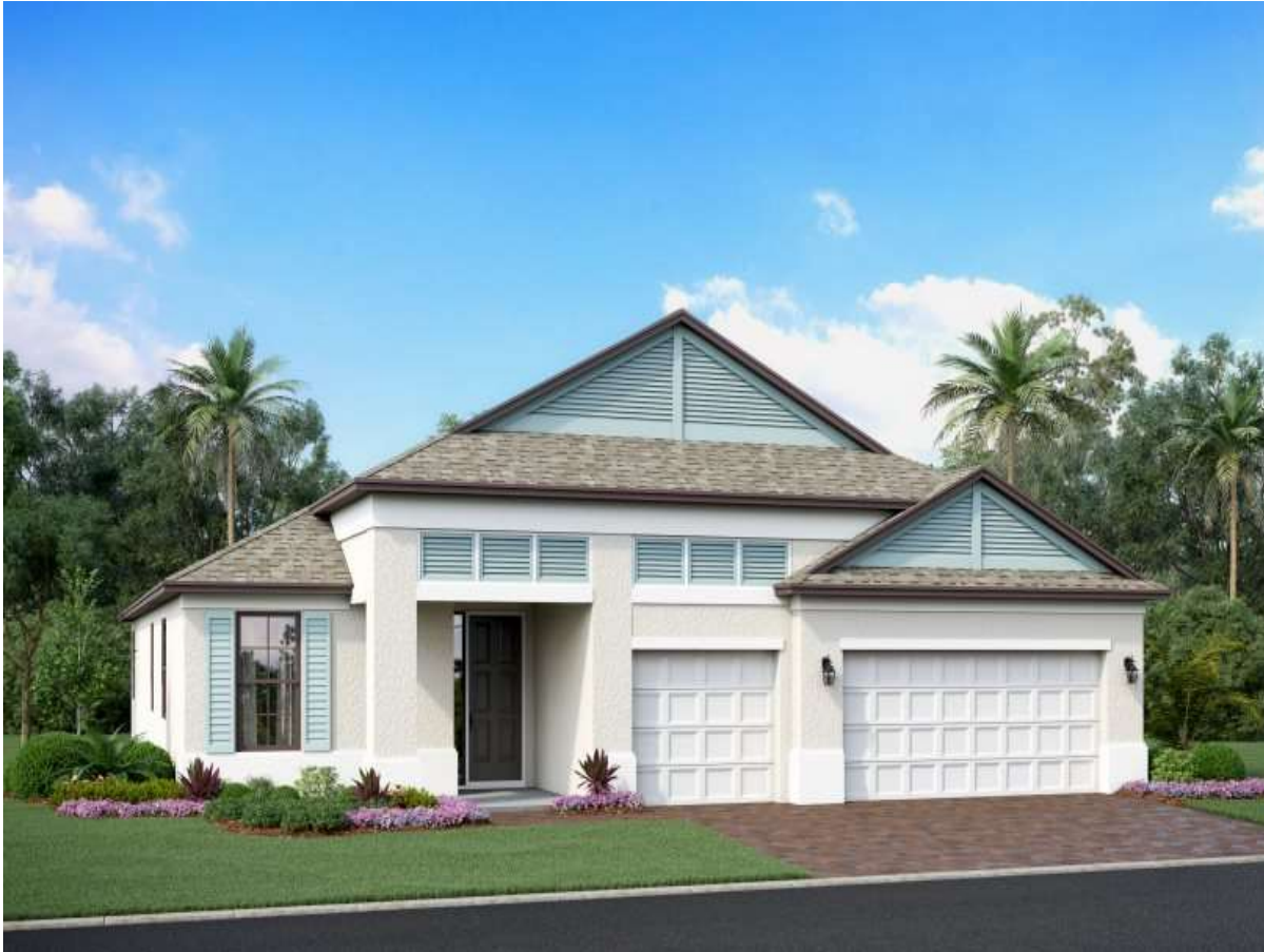
Elevation A British West Indies

2581 Sq. Ft. • 3 Bedrooms • 3 Full Baths • 3-Car Garage