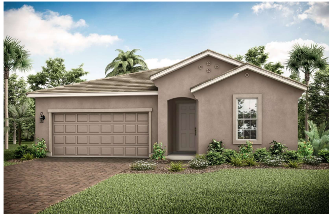
Elevation West Indies