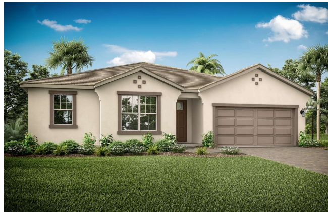
Elevation West Indies