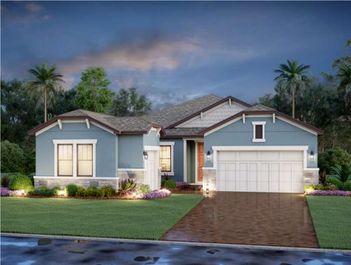
Elevation C Craftsman

2370 Sq. Ft. • 4 Bedrooms • 3 Full Baths • 3-Car Garage