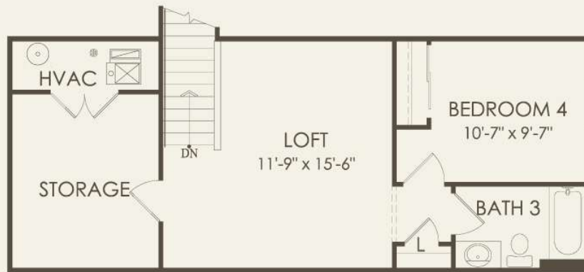
Opt. Second Floor w/ Slab