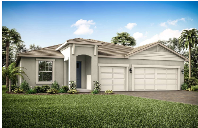
Elevation West Indies